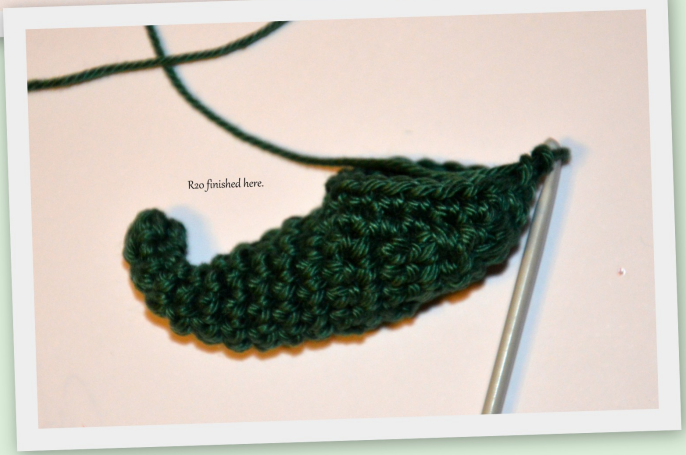
Reso finished here.