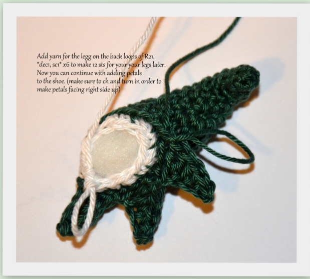
Add yarn for the legg on the back loops of R21. *dec1, sc1* x6 to make 12 sts for your legs later. Now you can continue with adding petals to the shoe. (make sure to ch and turn in order to make petals facing right side up)