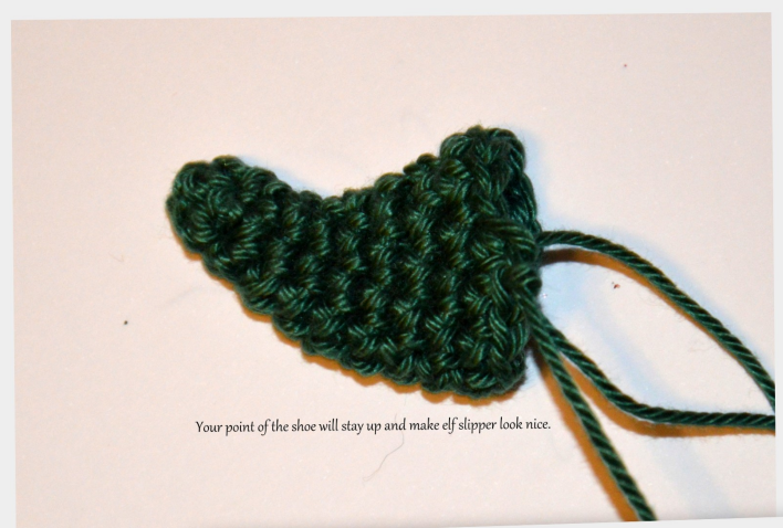
Your point of the shoe will stay up and make elf slipper look nice.