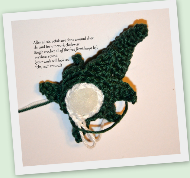
After all six petals are done around shoe, ch1 and turn to work clockwise. Single crochet all of the free front loops left previous round. (your work will look as: *ch1, sc2* around)