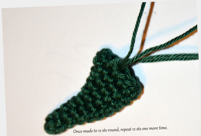
Once made to 12 sts round, repeat 12 sts one more time.